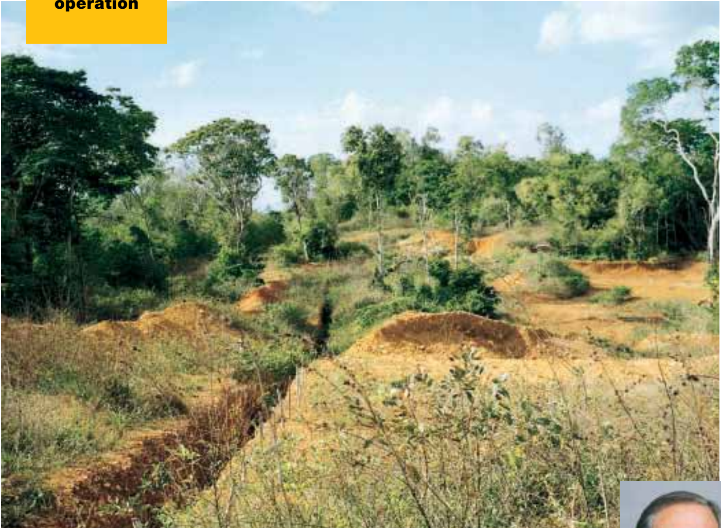
Geotechnical investigation site, Tomi Project, Venezuela

SRK recently completed a third party technical audit of the development and financing plans for the proposed 2.6 million tonne Tomi gold mining operation in central Bolivar State, Venezuela.