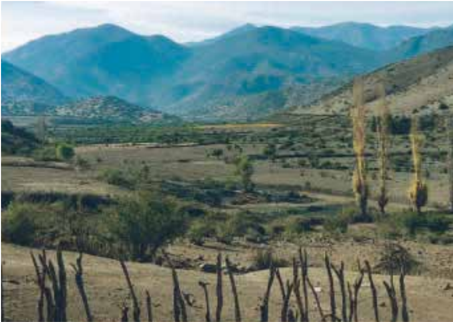
Inundation area of the proposed Corrales reservoir

In the first EIS of its type under the new regulations, SRK is assessing the impact of the proposed Corrales Reservoir located in the IV Region of Chile, a transitional zone between the extremely arid Atacama Desert and the Mediterranean climate of central Chile.