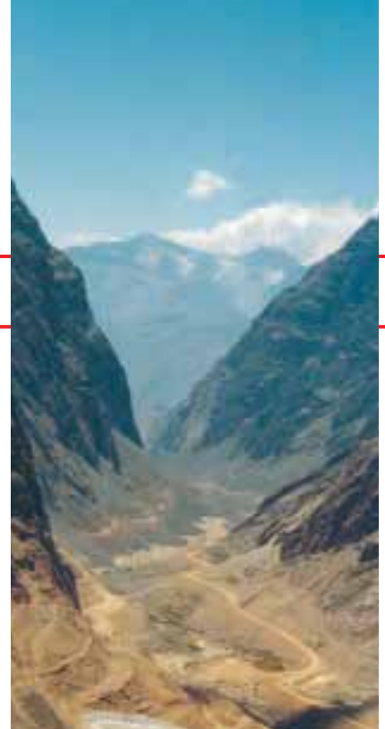
Blanco river valley, where the Andina Mine activities take place.