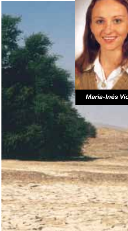
Indigenous tree in one of the groundwater supply alternative areas for the project

At the request of a confidential client, SRK has completed environmental studies for a proposed non-metallic mining project in the Atacama desert of northern Chile.