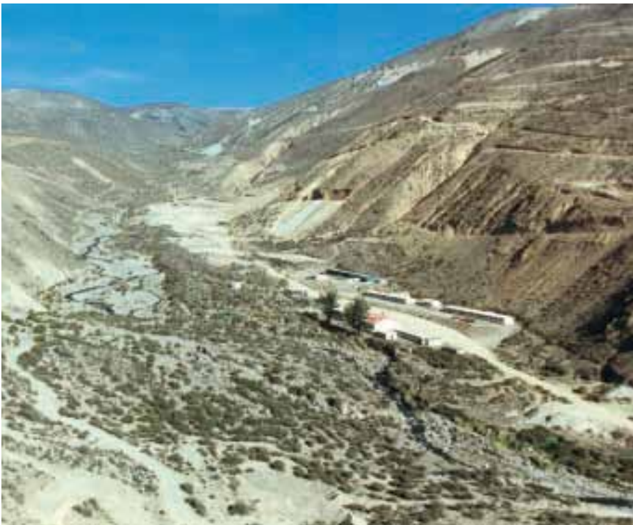
Asana Valley, the area of the proposed Quellaveco open pit mine.

In addition, mine closure aspects related to the formation of a pit lake were included in the final evaluation. The impact on the pit and rising ground water levels were modelled in order to determine their impact on slope stability.