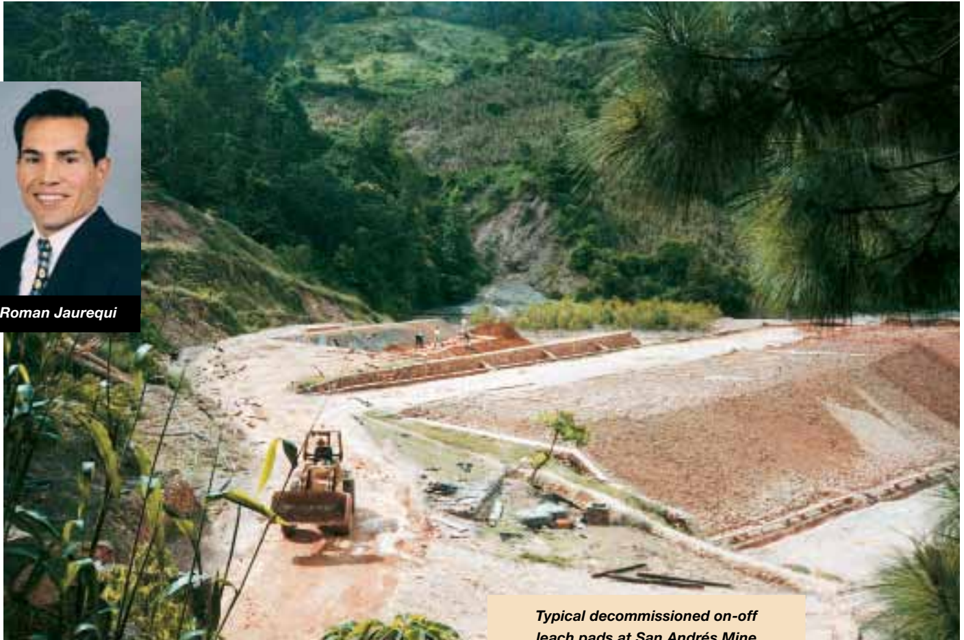
Typical decommissioned on-off leach pads at San Andrés Mine

SRK has been extensively involved in the expansion of Greenstone Resources' gold mining and processing operation, San Andrés, in the Department of Copán, western Honduras.