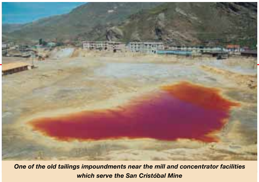
One of the old tailings impoundments near the mill and concentrator facilities which serve the San Cristóbal Mine

SRK was responsible for the environmental component of the assessment. Information related to the local environmental regulations and conditions was provided by SVS S.A. of Lima.