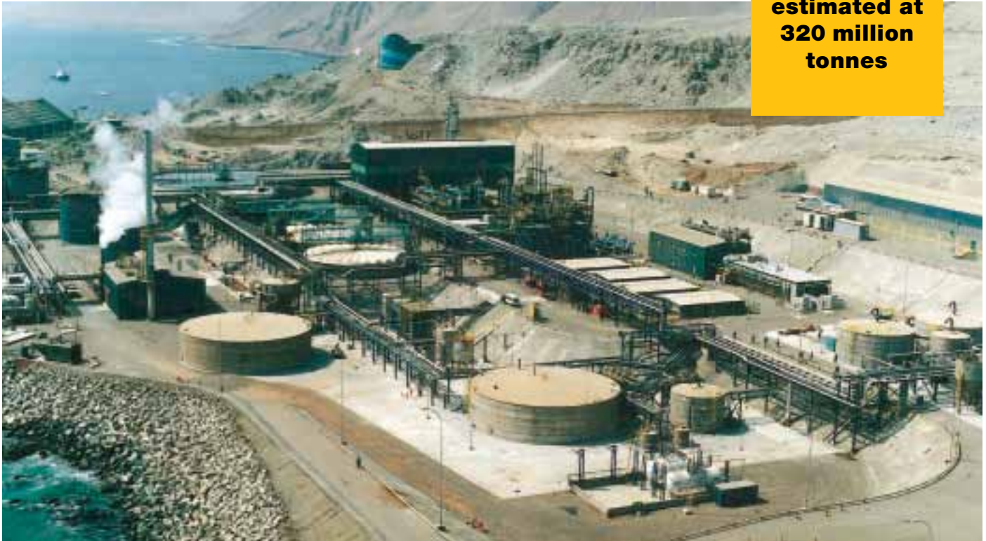
The facilities at Punta Coloso were part of the extensive list of projects components considered by the recently completed Escondida closure plan.

Reserves are estimated at 320 million tonnes