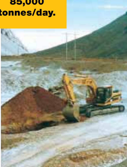
Test pit in the Pelambres valley for the study of the future waste dumps location

SRK has been involved with the Pelambres open pit copper porphyry mine which is planning to increase the planned production to 85,000 tonnes per day.